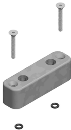
GTP-9782 Gammon Adapter