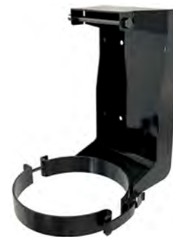
Mounting Bracket (Optional)

ACCORDING TO THE REQUIREMENTS OF EUROPEAN PRESSURE EQUIPMENT DIRECTIVE (PED) 2014/68/EU ART. 4.3, WITHIN THE OPERATING LIMITS PROVIDED ON VESSEL NAMEPLATE AND SUMMARIZED BELOW, THESE FILTERS ARE DESIGNED AND MANUFACTURED IN ACCORDANCE WITH THE SOUND ENGINEERING PRACTICE AND EXEMPT FROM CE MARKING AND CERTIFICATION: 10 BAR(G) @ 35°C FOR AV-GAS AND JET FUEL.