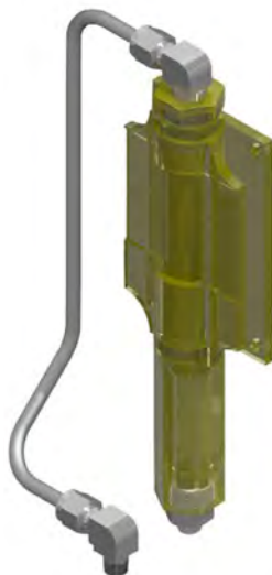
GTP-9739 Gammon Installation Kit