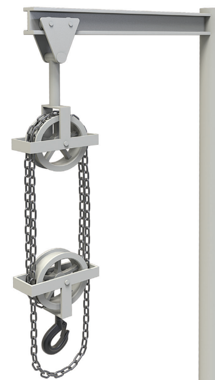
Cartridge Hoist (optional)