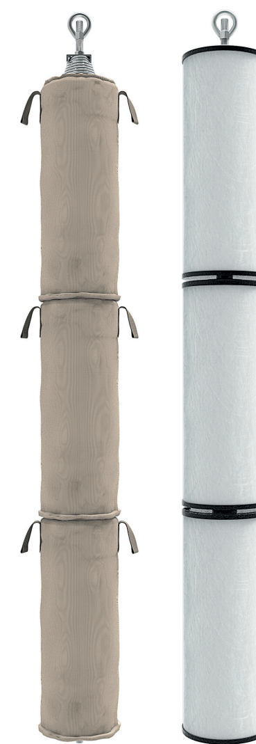
Facet Bag & Canister Cartridges